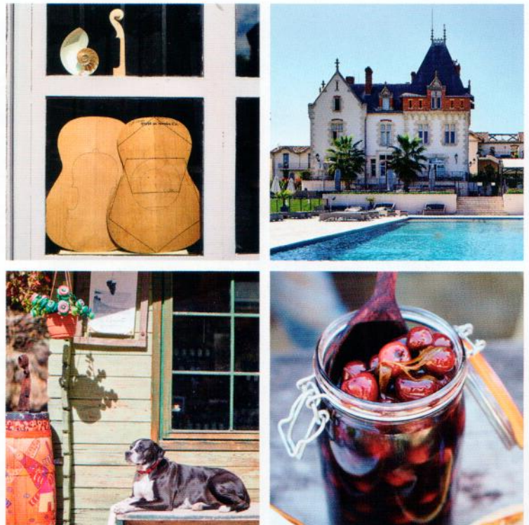
A day spent tasting red-wine vinegar in the Banyuls-sur-Mer town ends with a drive north to overnight at Château St Pierre de Serjac, set in a lush, 200-acre vineyard.