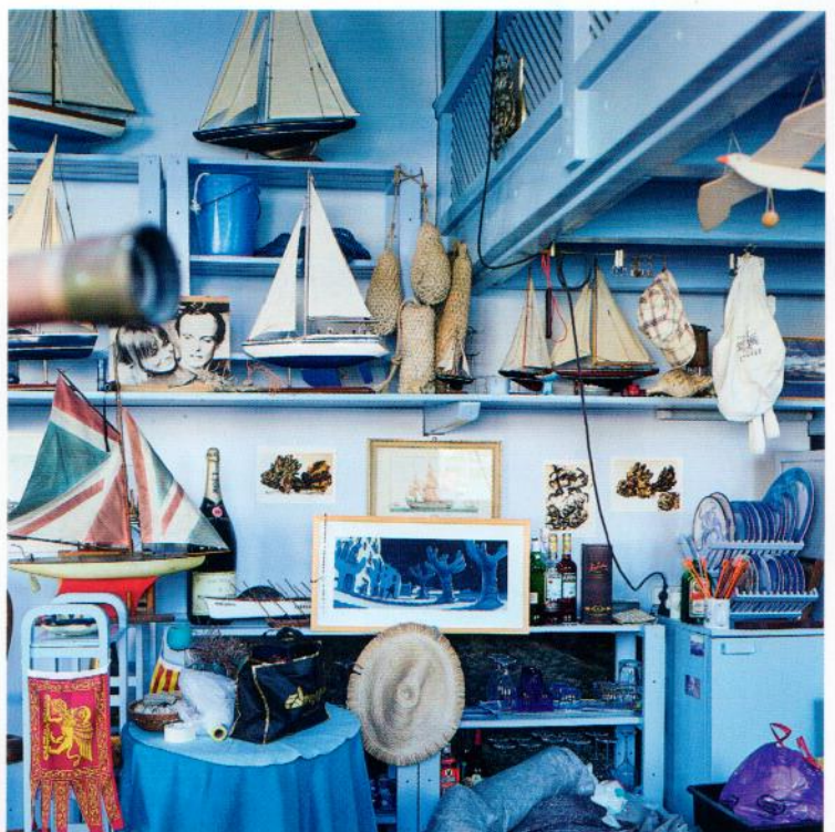
We found those signature Cadaqués blues again in a boat mender's workshop near the modernist Casa Serinyana building. To hire the Mercedes-AMG C 43 Cabriolet and other cars across Europe, see driverso.com