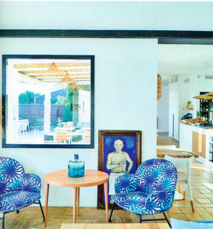
el Villa Gala is a love letter to the whites and cobalts Cadaqués - the seaside town that inspired Pablo Picasso, n Miró and Marcel Duchamp, and where Dalí owned a house.